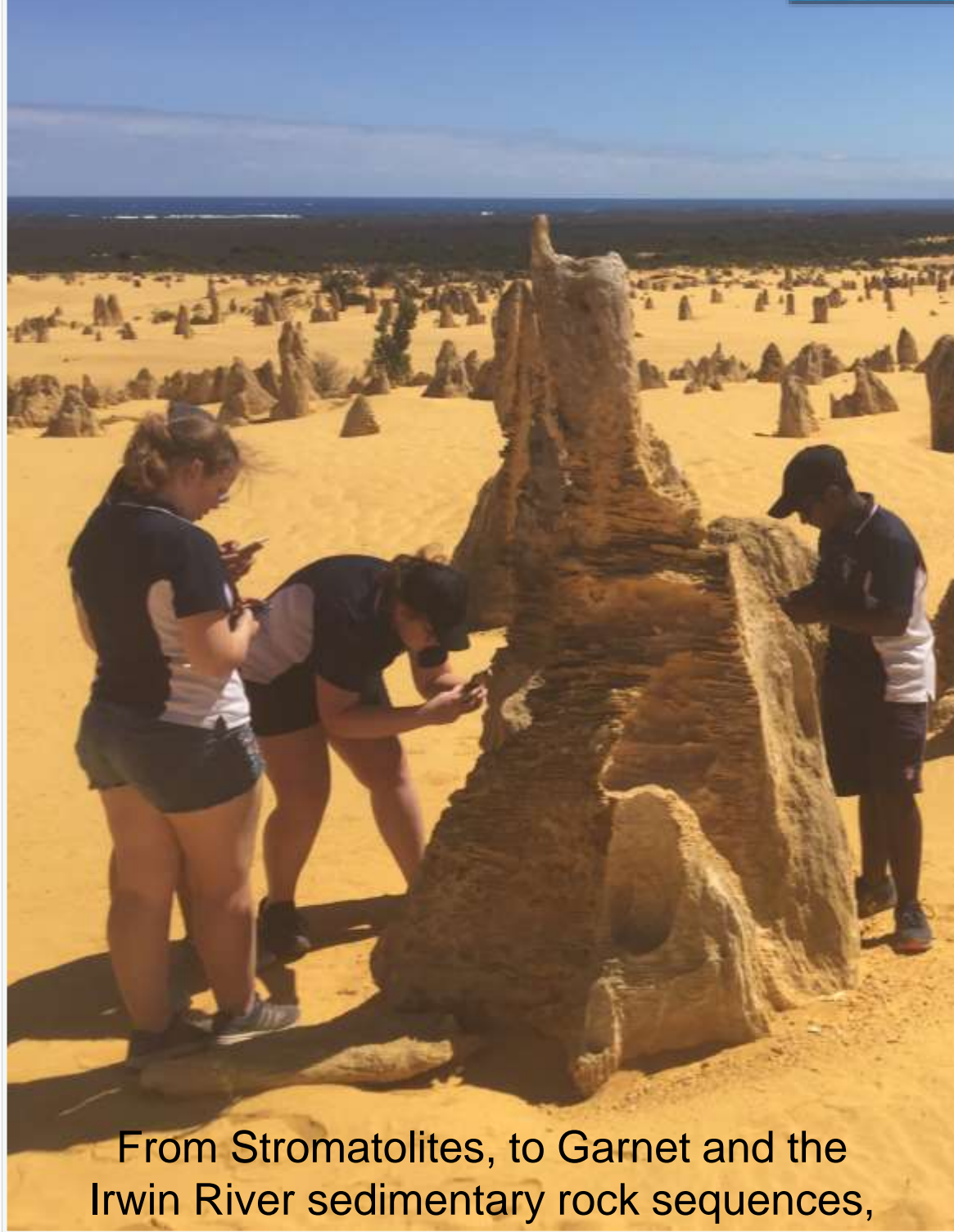
From Stromatolites, to Garnet and the Irwin River sedimentary rock sequences, a hole semester's worth of understanding achieved in #therealclassroom